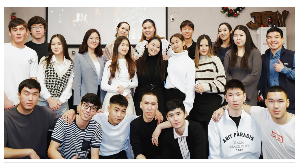
Pray for new young believers in Qazaqstan!

Millions of Qazaq people were able to watch our videos, thousands were deeply touched, and many decided to follow Jesus.