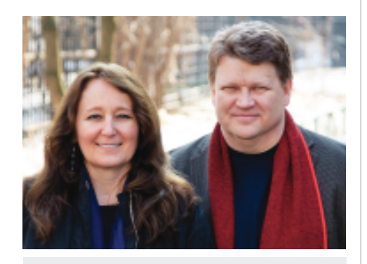
"We focus on one thing: inspiring people to follow Jesus."