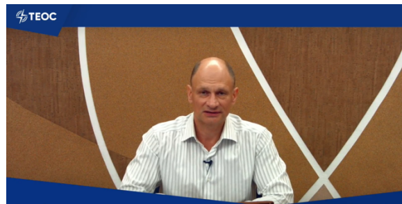
... and preaching